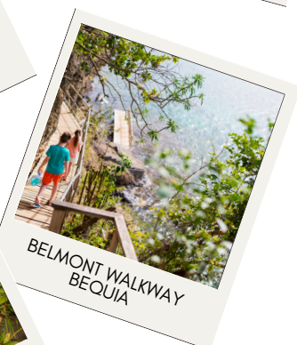
BELMONT WALKWAY BEQUIA