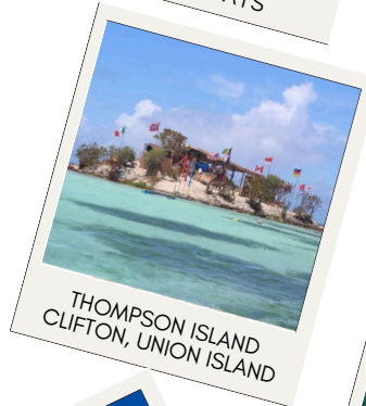
THOMPSON ISLAND CLIFTON, UNION ISLAND