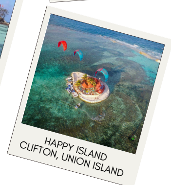
HAPPY ISLAND CLIFTON, UNION ISLAND