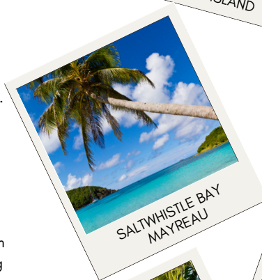
SALTWHISTLE BAY MAYREAU