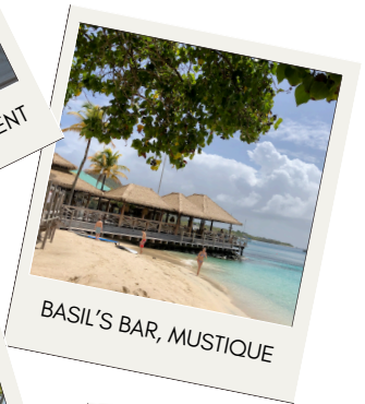
BASIL'S BAR, MUSTIQUE