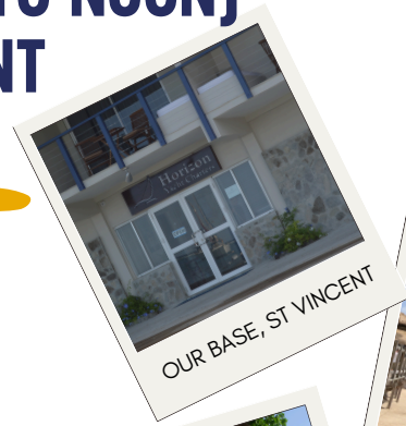
OUR BASE, ST VINCENT

www.horizonyachtcharters.com/stvincent/ info@horizonstvincent.com 1 904 638 2373