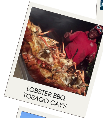
LOBSTER BBQ TOBAGO CAYS